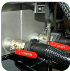
Mechanical valve at drain hose as standard.