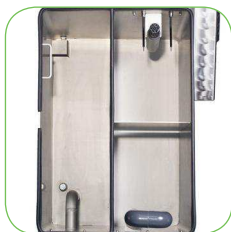
The tank is made of stainless steel (steel grade no. 1.4404).