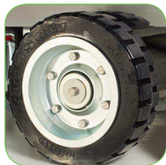
Traction wheels made of PU with profile.