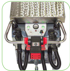
Handle made of stainless steel.